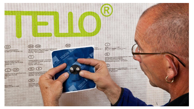
Also available as KAFLEX duo

KAFLEX duo is pre-fabricated with two holes in the EPDM for quick and reliable penetrations with two cables of diameters of 4.8 - 12 mm (3/16"-1/2"). Use of the KAFLEX cable loom grommet is recommended if a number of cables are to be reliably integrated into the airtightness layer.