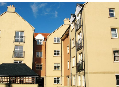
Think Exteriors, Think Keim Keim Granital - Traditional Mineral Paint