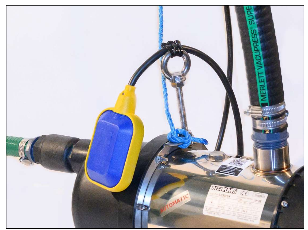
SteelPump showing Threaded bar, Float Switch and Lifting Rope