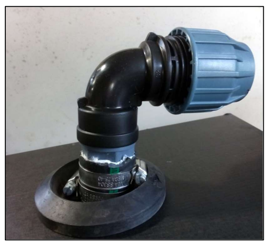
Push the Hose Bung (Grommet) into the hole