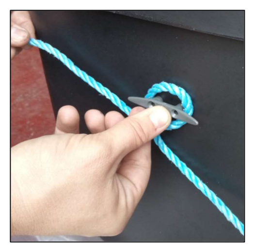
Attach the Rope Cleat outside the Tank